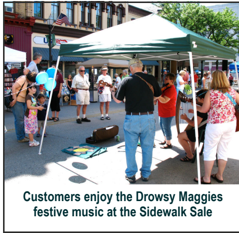
Customers enjoy the Drowsy Maggies festive music at the Sidewalk Sale

The Kids Zone, presented by The Garden was packed with fun activities for the kids. The Garden had art