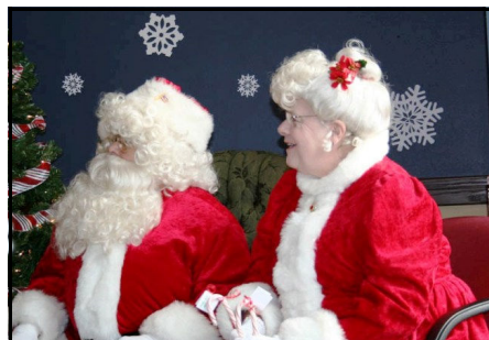
Santa and Mrs. Claus love being downtown for Home for the Holidays

On December 5, the DFP will host Home for the Holidays. Activities start at 8 a.m. with Breakfast with Santa at the