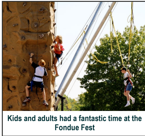
Kids and adults had a fantastic time at the Fondue Fest

contests; The Nielsen Co. had a hole in one, and the rest of the Kids Zone was alive with the bounce house, bungee run, bungee rock wall and giant slide. Sunshine the Clown handed out balloon