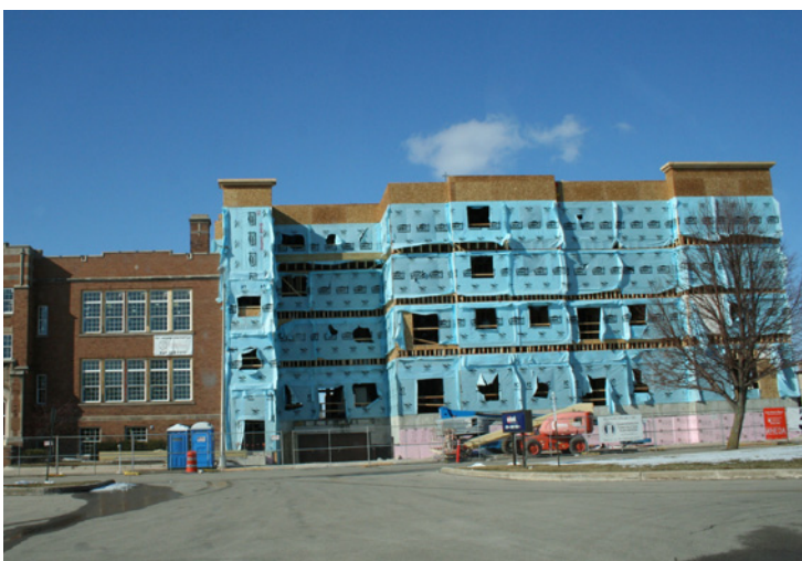
St. Peter's Place during construction and how it looks today.