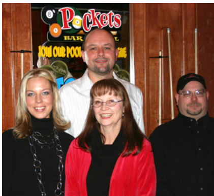
The team from Main Exchange and Pockets (left) created the 1st and 2nd place chillies. Blueprint Solutions (right) had 4 different chillies, including the 3rd place winner. For more pictures of the event and winners, visit us on Facebook.