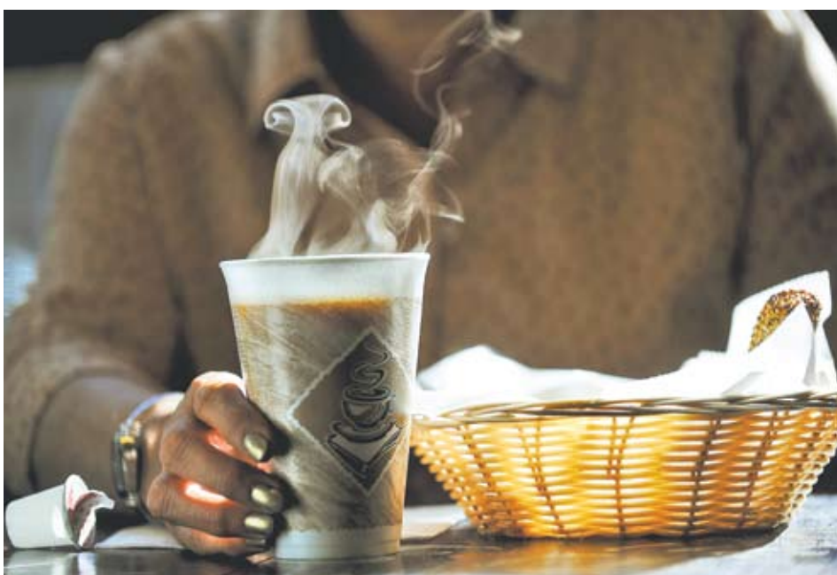
The Bagelmeister at 110 S. Main St. is a popular downtown dining spot.